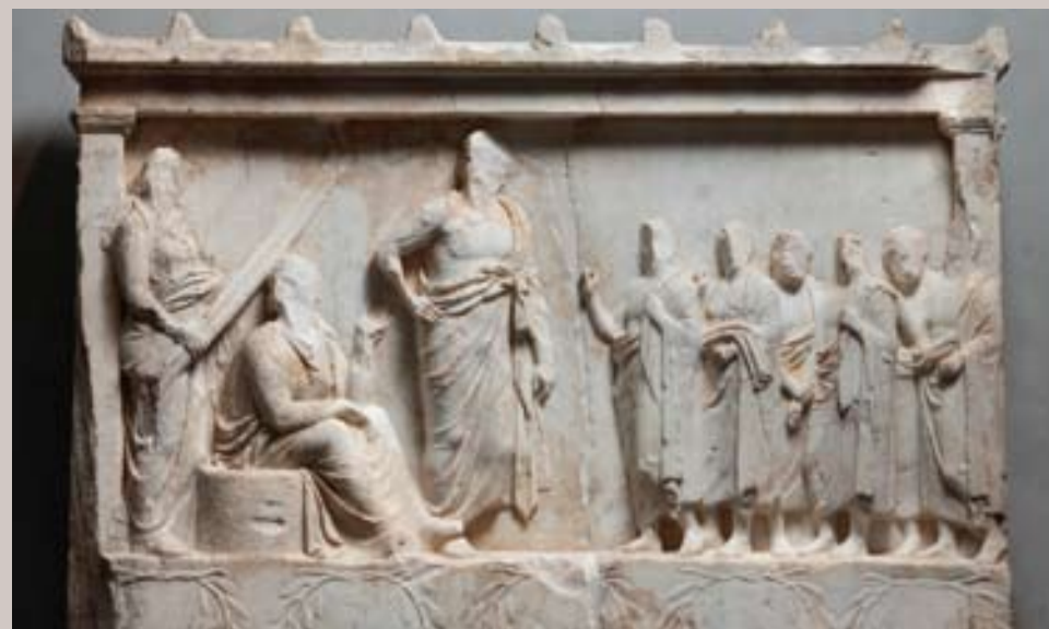
Fig. 2 NMA 1332. Votive relief depicting Asclepios, Demeter and Kore (Persephone), who receive worshippers. Second half of the 4th c. BC