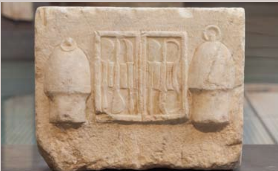
Fig. 3 NMA 1378. Base of a votive offering with a relief depicting surgical instruments and suction cups (sikyies). 320 BC