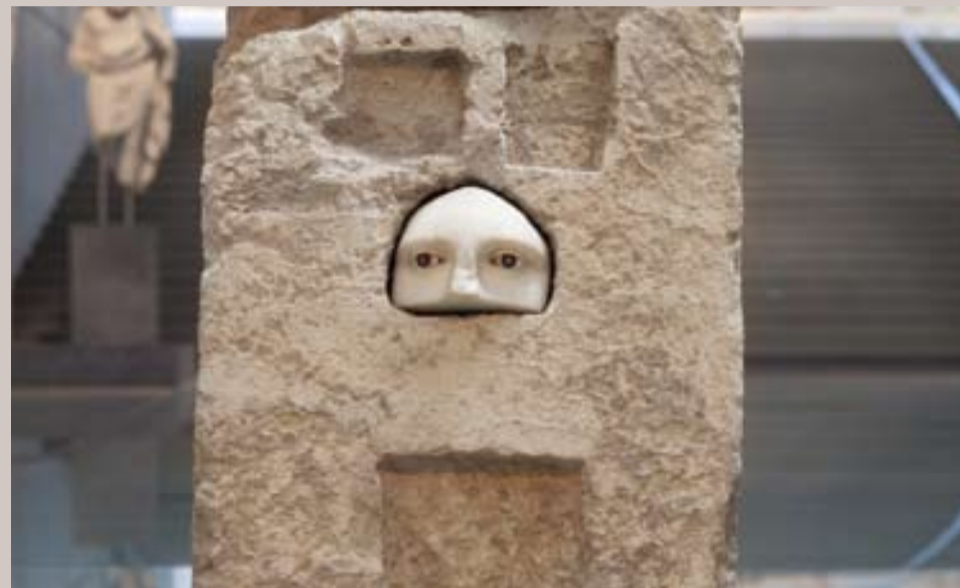
Fig. 4 NMA 15244. Part of a female face, votive offering by Praxias in the sanctuary of Asclepios. Second half of the 4th c. BC